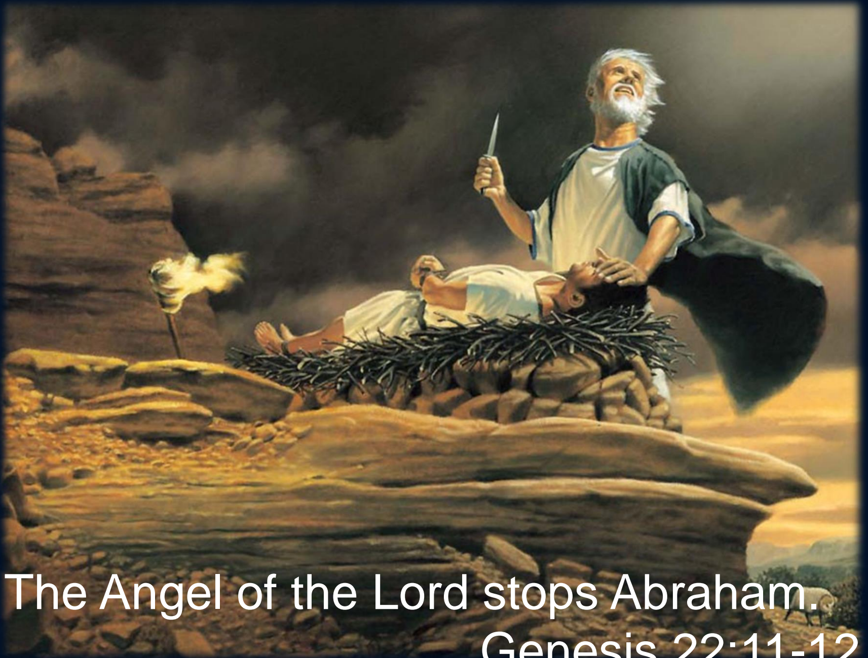
The Angel of the Lord stops Abraham. Genesis 22:11-12