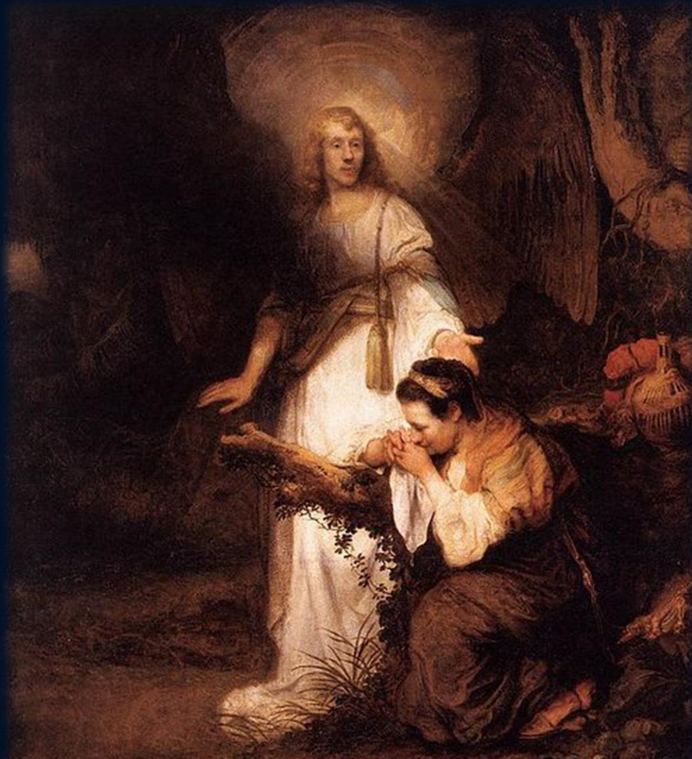
Hagar meets the Angel of the Lord. Genesis 16:7-13