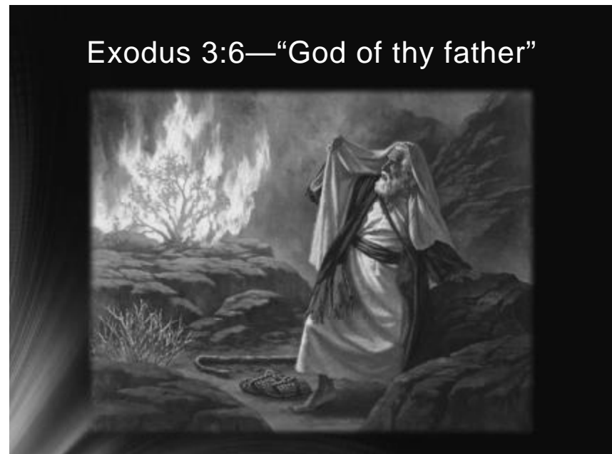
Exodus 3:6—"God of thy father"