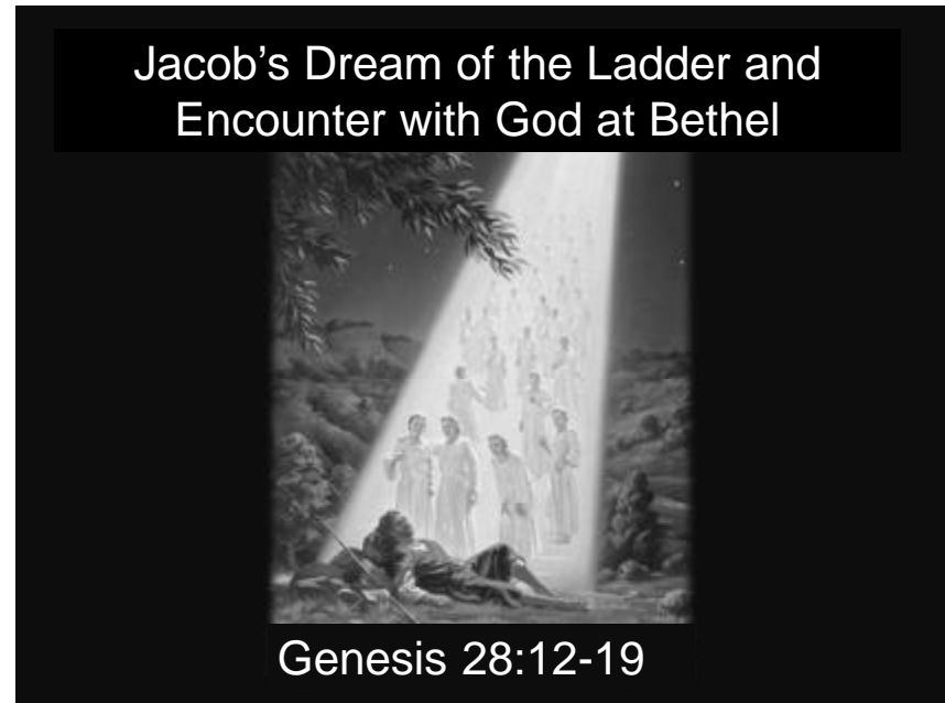
Jacob's Dream of the Ladder and Encounter with God at Bethel