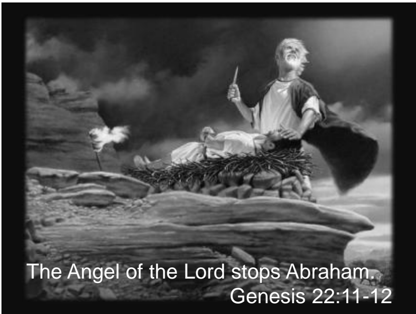
The Angel of the Lord stops Abraham. Genesis 22:11-12