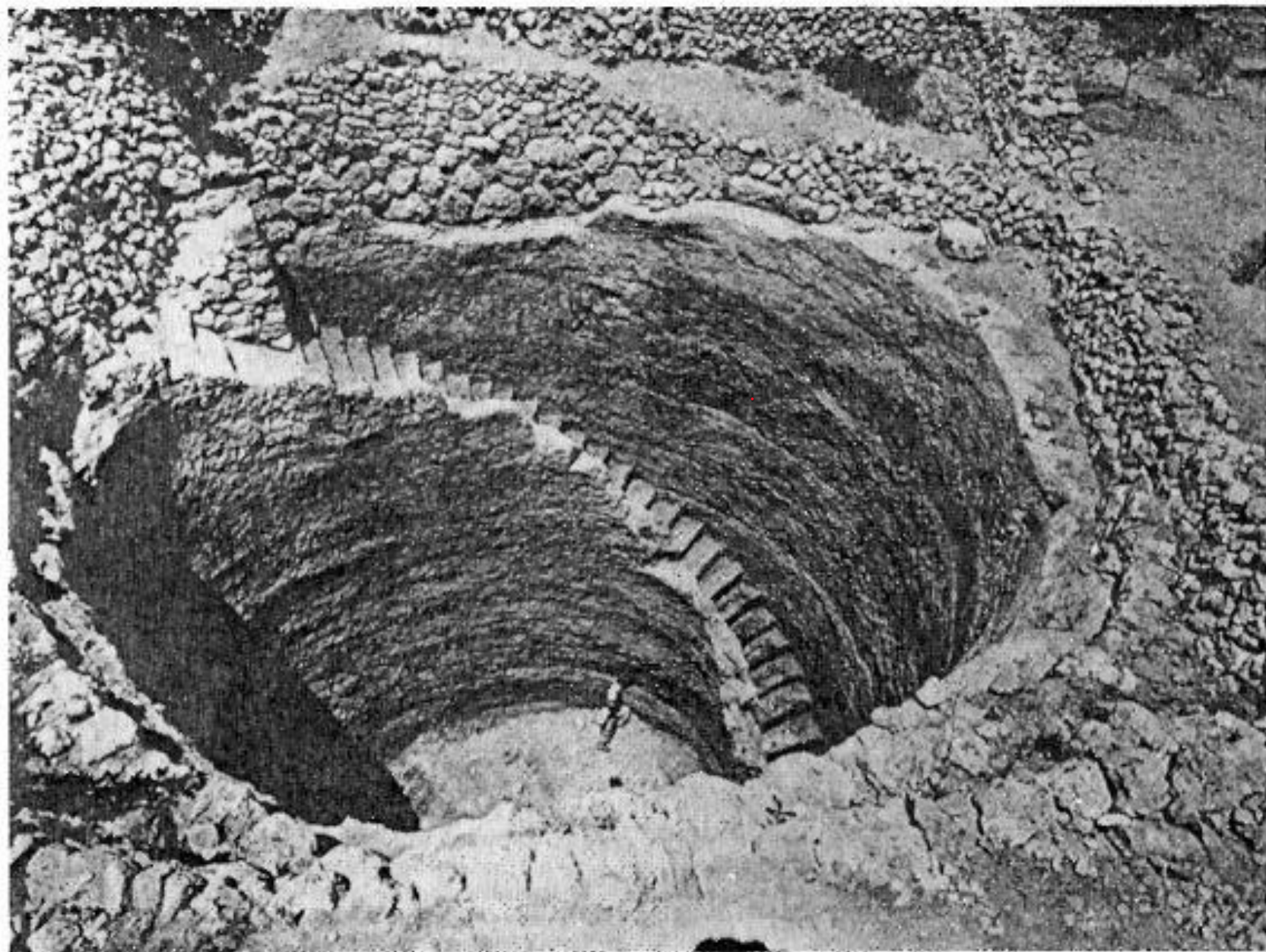
Diagram 6. The Pool of Gibeon—a great water-shaft sunk into the bedrock to reach the water table.