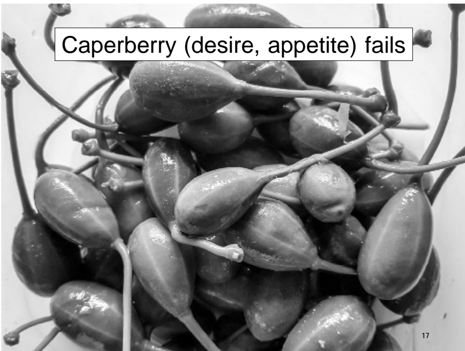
Caperberry (desire, appetite) fails