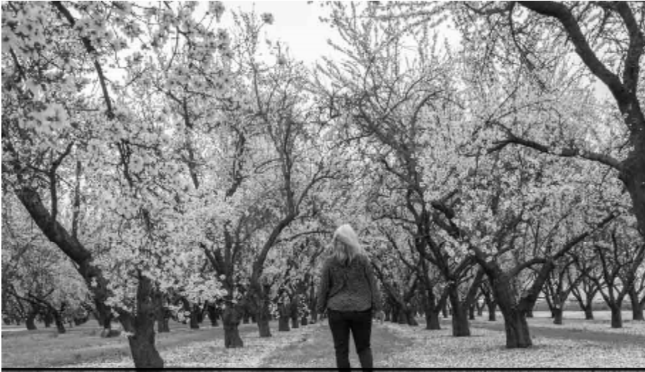
The almond tree blossoms.