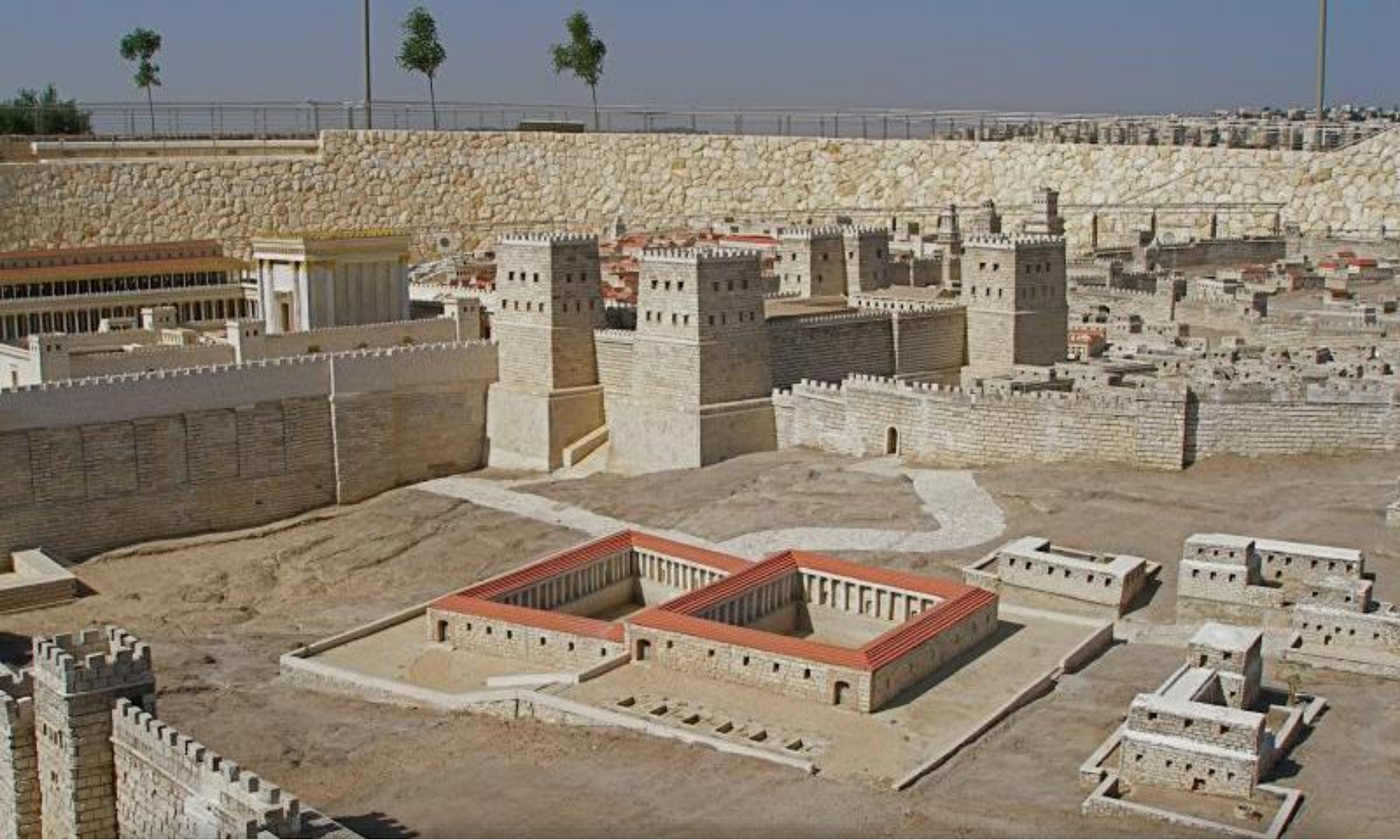
Pool of Bethesda