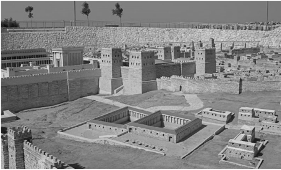
Pool of Bethesda