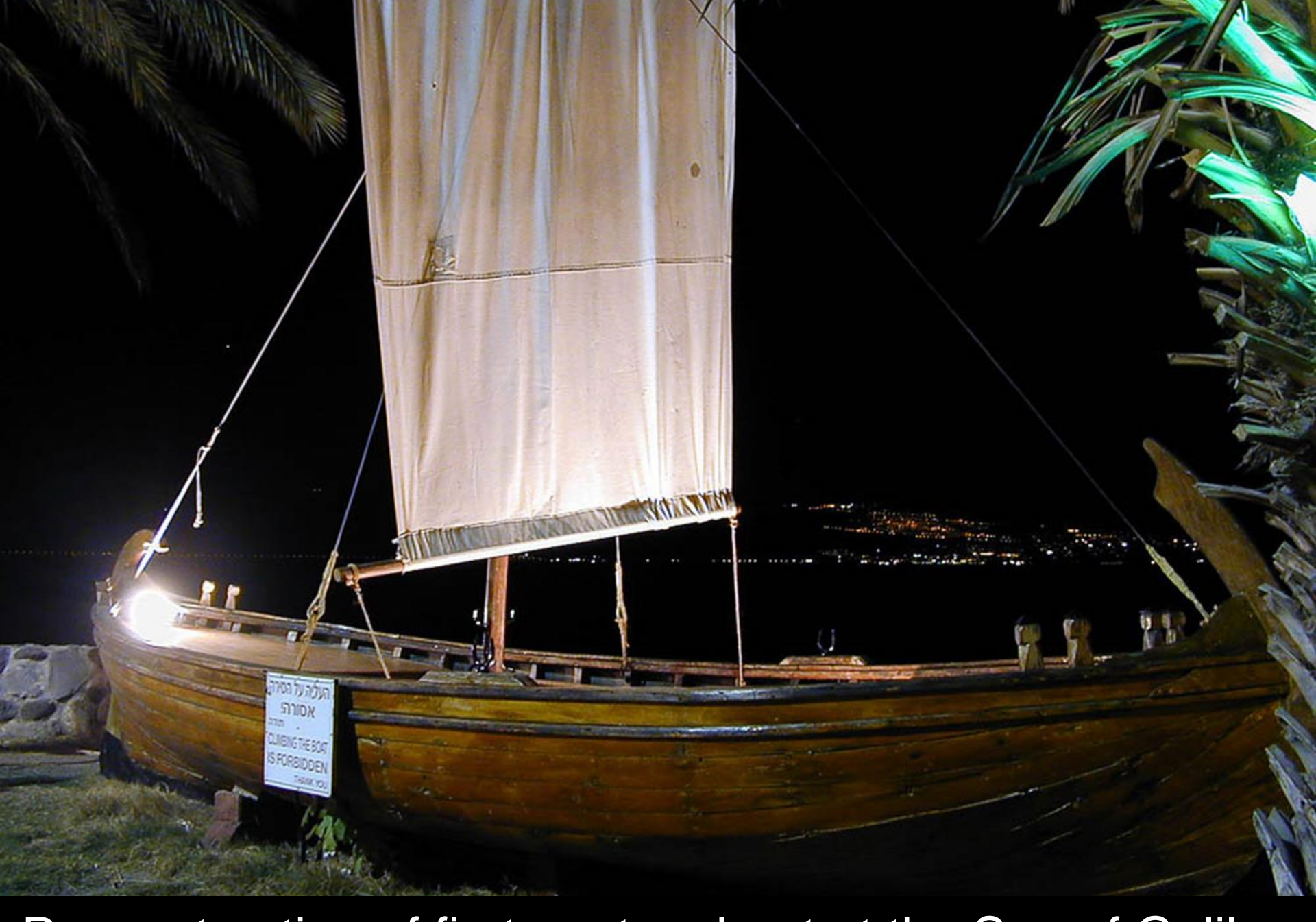
Reconstruction of first-century boat at the Sea of Galilee