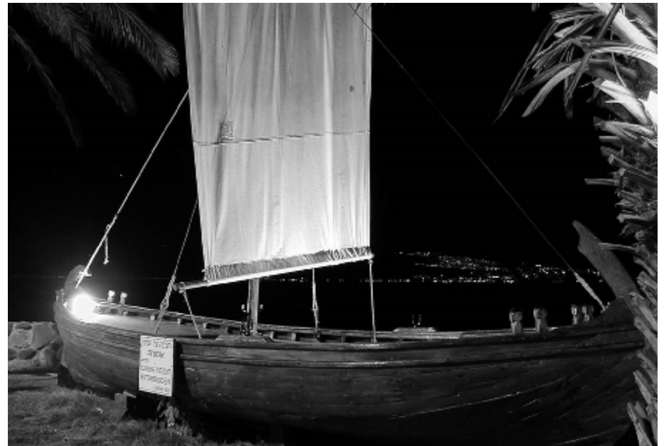
Reconstruction of first-century boat at the Sea of Galilee