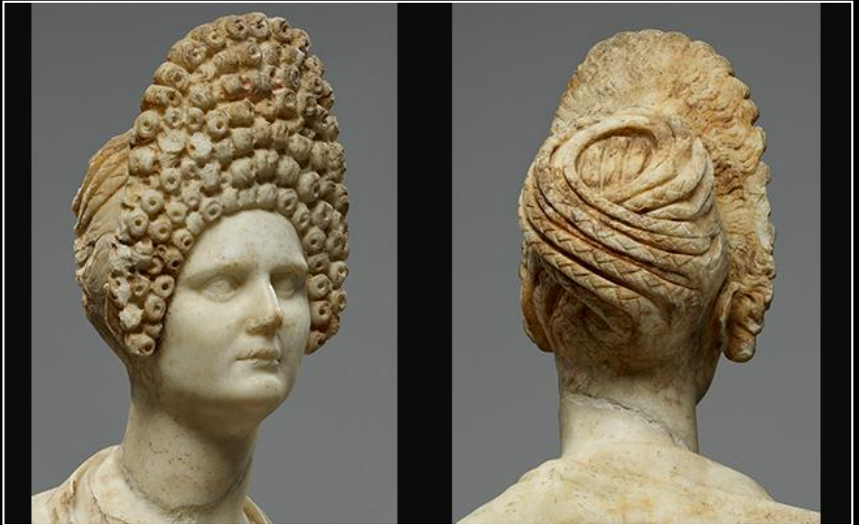
Bust of an Aristocratic Roman Woman