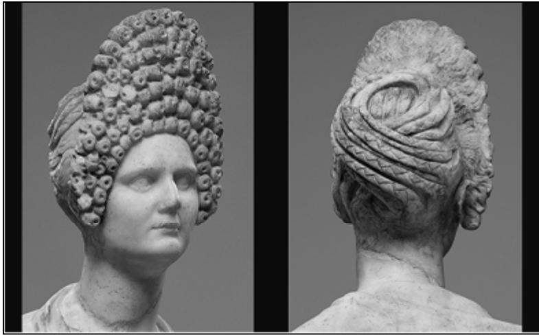
Bust of an Aristocratic Roman Woman