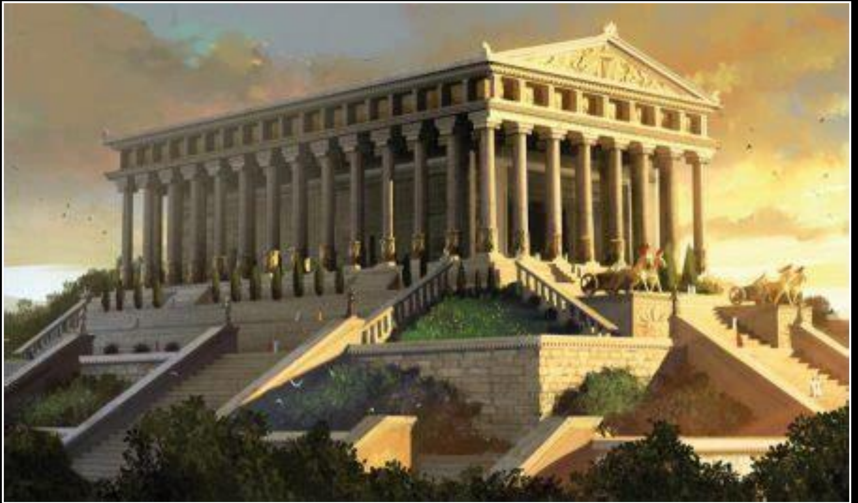
Temple of Diana, Ephesus