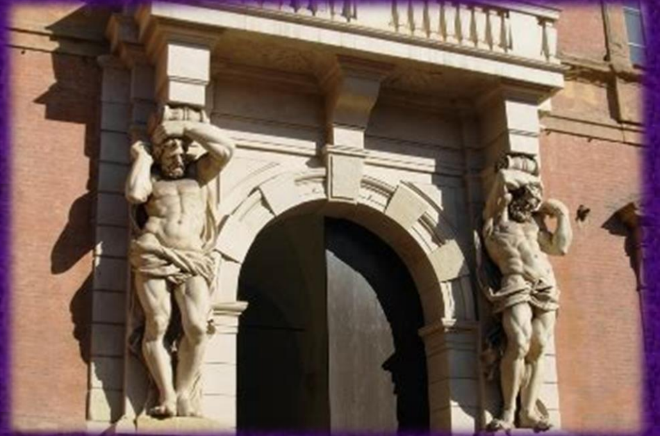
Telamon or Atlas: Male Pillar