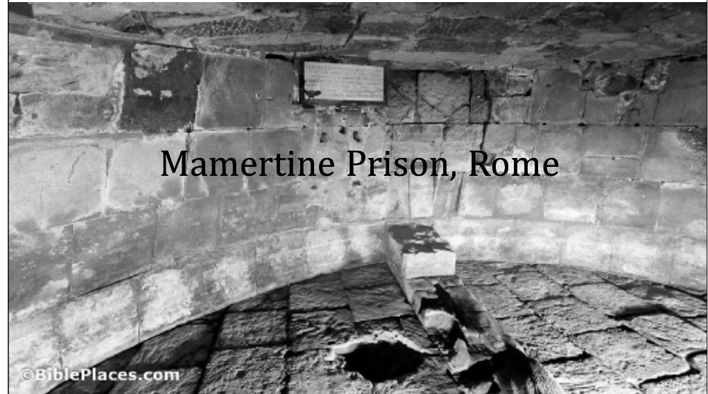
Mamertine Prison, Rome