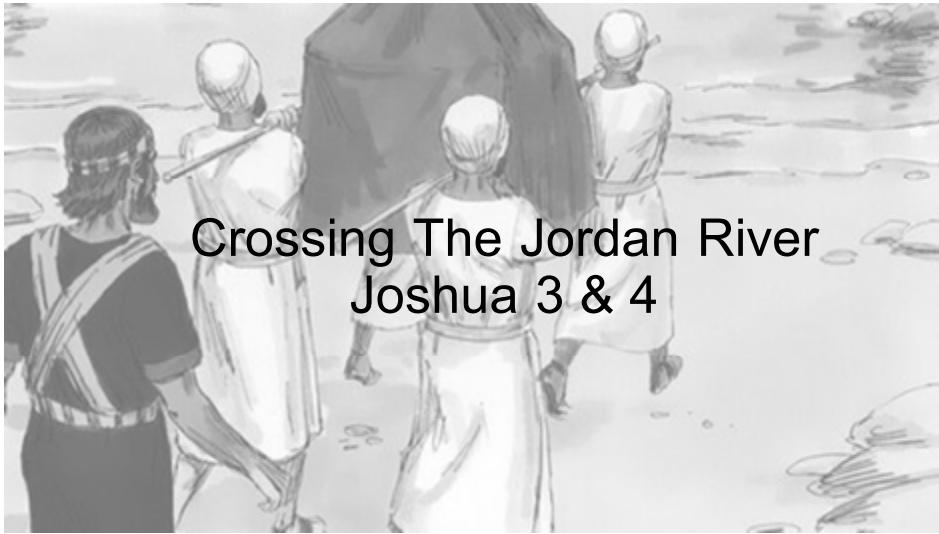
Crossing The Jordan River Joshua 3 & 4

The Ark is mentioned 17 times in Joshua 3 & 4.