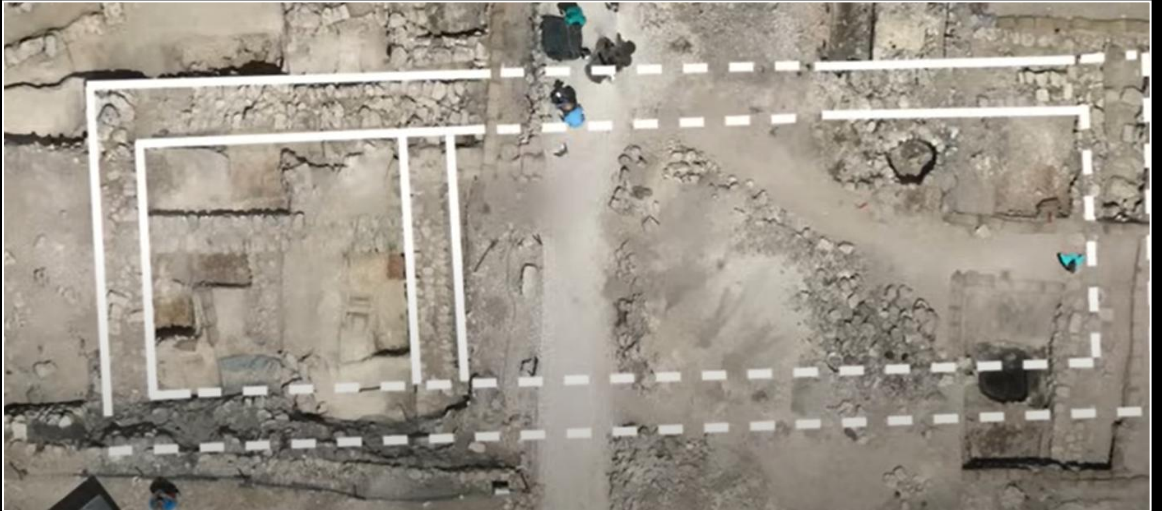
Possible Remains of Tabernacle at Shiloh