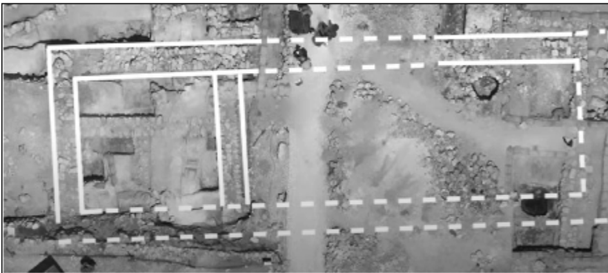
Possible Remains of Tabernacle at Shiloh