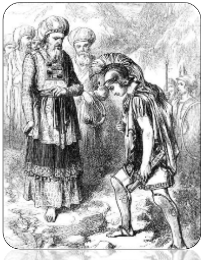
Alexander the Great Meeting the Jewish High Priest